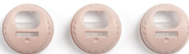
Figure 1- Provox FreeHands FlexiVoice/Provox Life FreeHands FlexiVoice