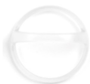
Figure 2- Provox FreeHands FlexiVoice Arch