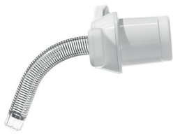
REF 370 without H 2 O Cuff