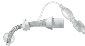
REF 373 with H 2 O Cuff, proximal longer

Standard tubes and length variants (C-Variants) for REF 370 / REF 371 / REF 372 / REF 373