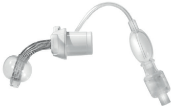
REF 372 with H 2 O Cuff